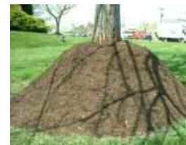
Volcano mulching suffocates surface roots of trees.