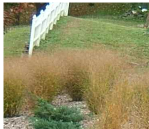
Panicum virgatum 'Shenandoah'

April: Leave grass clippings; mulch properly