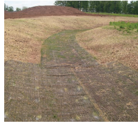
Correct Installation of Matting In a Swale